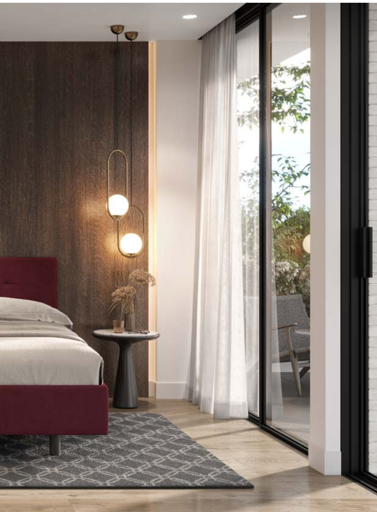
Frame design height 25 cm, fabric 6223, headboard 3 stapled height 105 cm, fabric 6223, foot 1 set back height 15 cm