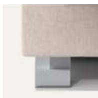
Corner foot 6 chrome 10 cm 15 cm