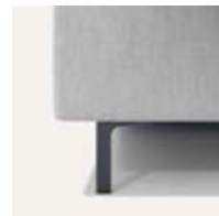
Corner foot 4 metal black 15 cm