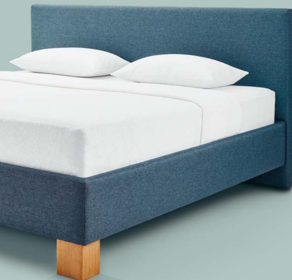
Frame design height 25 cm, fabric 2300, headboard 1 flat height 105 cm, fabric 2300, corner foot 5 oak height 15 cm