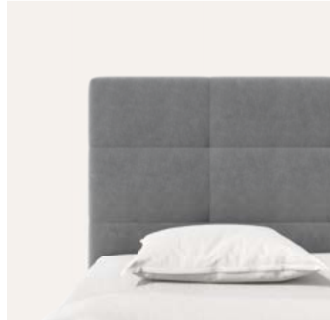
Headboard 2 check patterned 105 cm Overhang on both sides 5 cm each 125 cm Thickness of headboard 7 cm