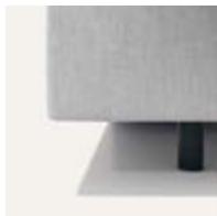
Foot 1 black set back 10 cm 15 cm