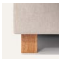
Corner foot 5 oak 10 cm 15 cm