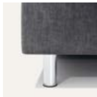
Corner foot 2 brushed aluminium 10 cm 15 cm