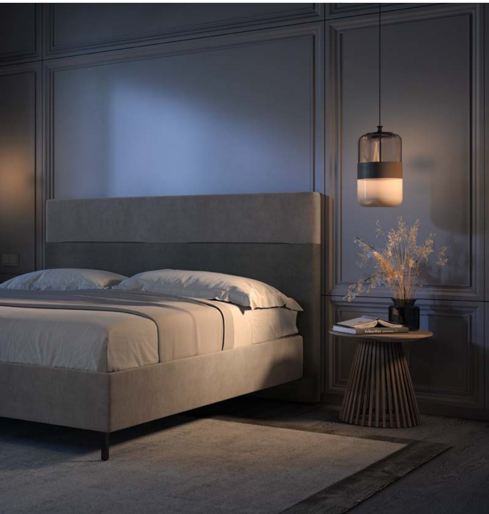
Frame design height 25 cm, fabric 2410, headboard 4 bicolour height 125 cm, fabric 2410/faux leather 3040, corner foot 4 metal black height 15 cm