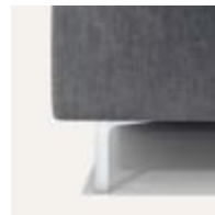
Corner foot 3 chrome 15 cm