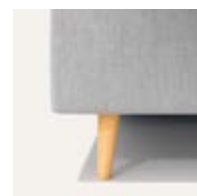
Corner foot 7 beech 15 cm