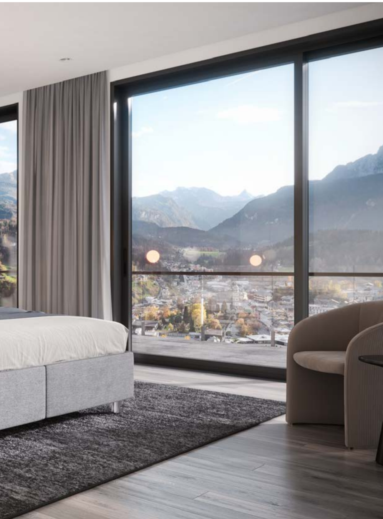
Frame comfort height 35 cm, fabric 6230, headboard 2 check patterned height 125 cm, fabric 6230, corner foot 2 brushed aluminium height 10 cm