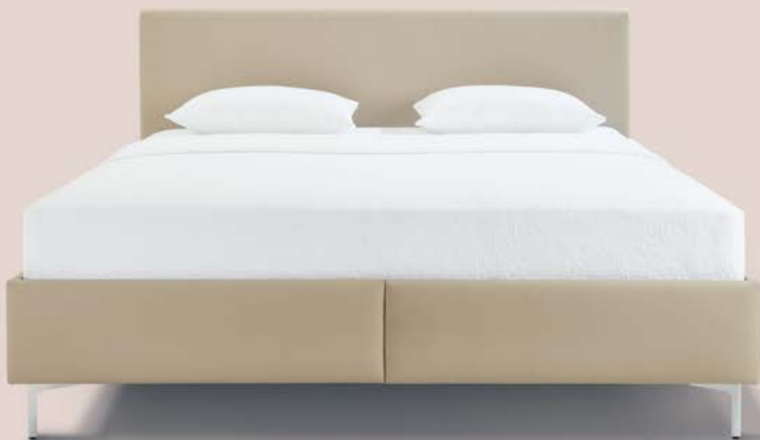
Frame design height 25 cm, faux leather 6212, headboard 1 flat height 105 cm, faux leather 6212, corner foot 3 chrome height 15 cm