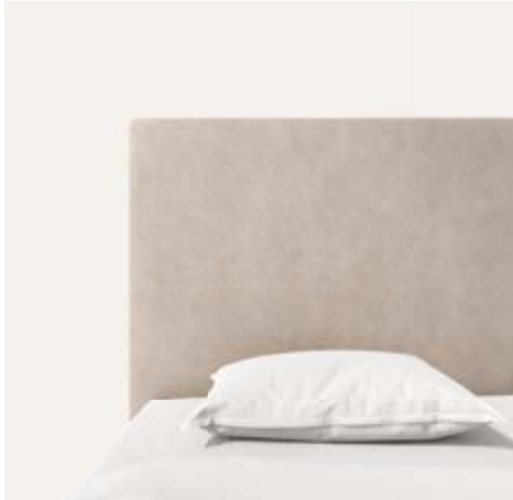
Headboard 1 flat 105 cm Overhang on both sides 5 cm each 125 cm Thickness of headboard 7 cm